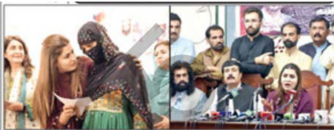
کوئٹہ: وزیر وفاقی شازیہ مری پریس کانفرنس کا ٹرانسمیٹنگ سسٹم چیک کر رہی ہیں