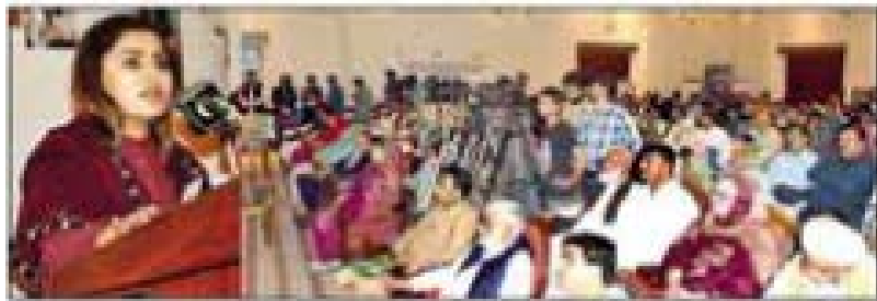
کوئٹہ، وہ جاتی دیر برائے تخفیف غربت اور سماجی تحفظ شاز پیر مری پٹی پی اے ایف کی چاب سے منصفہ و قریب سے خطاب کر رہی ہیں۔

کوئٹہ (اسٹاف رپورٹر) وفاقی وزیر تعلیم حضرت و سنی حفظہ و جہیز حسن جینگیر اہم سپورٹ وگرام شہار یہ مری نے کہا ہے کہ کلک بھرسا نہ آئی انکس پی کی مالی معاونت سے ایسا لکھنا محسوس استقامت کر رہے ہیں، پسماندہ اور غریب طبقات کی مالی معاونت کے لئے 28 ارب (باقی صفحہ 5 نمبر 28) کوئٹہ (اسٹاف رپورٹر) وفاقی وزیر تعلیم حضرت و سنی حفظہ و جہیز حسن جینگیر اہم سپورٹ وگرام شہار یہ مری نے کہا ہے کہ کلک بھرسا نہ آئی